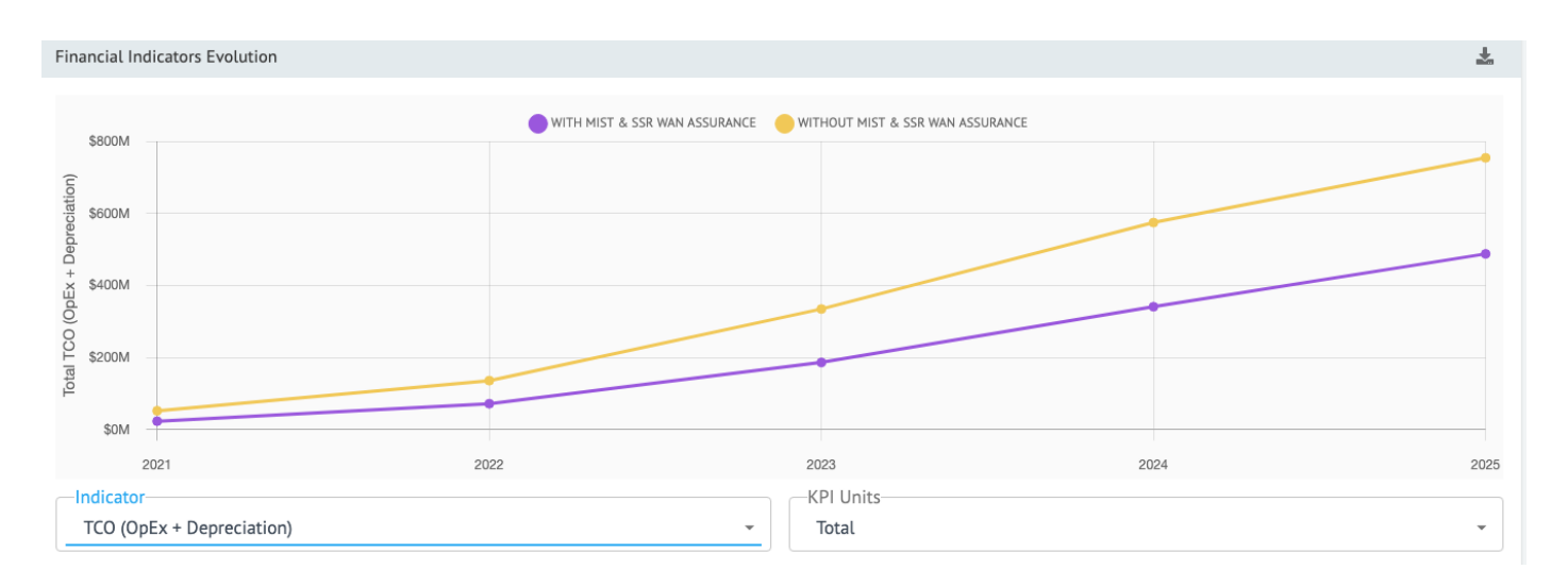
Figure 3. Year-by-Year Comparison TCO with Wired, Wireless, and SD-WAN Driven by Mist AI and without Mist AI Scenarios