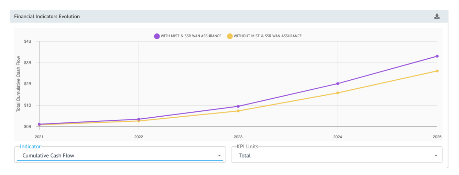
Figure 2. Year-by-Year Comparison of Cumulative Cash Flow for with Wired, Wireless, and SD-WAN Driven by Mist AI and without Mist AI Scenarios